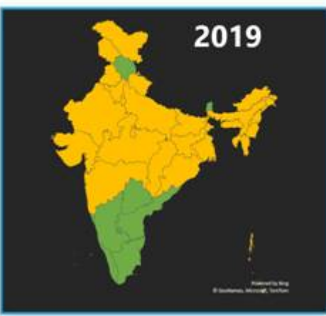
India's Index Score: State/UT Performance (2019 to 2020)

In 2020, 12 States/UTs joined the category of Front Runners